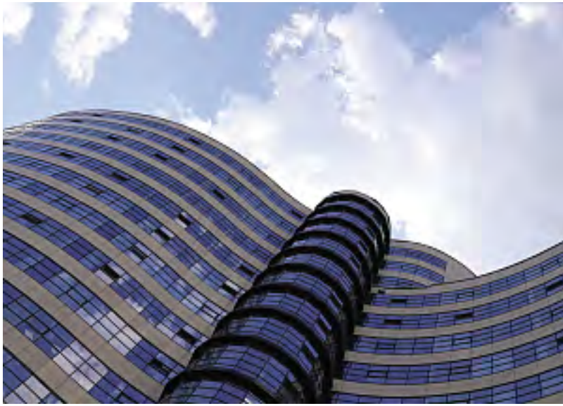
Ahead of the curve: Belarus's Hi-Tech Park already plays host to a number of foreign firms, including strategy game developer WarGaming (pictured), but it is looking to attract even more

IBM, Expedia, BP, Chevron, Microsoft and Airbus, to name but a few.