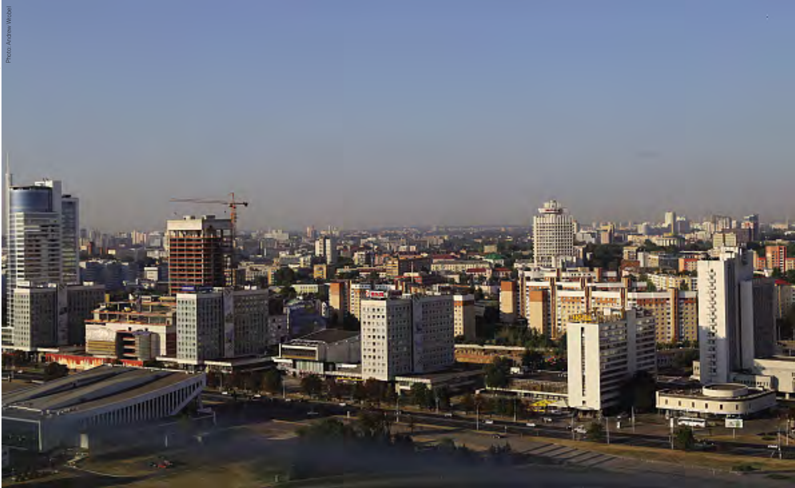
Building blocks: Belarus is working on modernising its economy, which will involve privatising state-owned companies

international trade. According to the European Commission, however, the EU-Belarus bilateral trade in goods has been growing steadily in recent years and the EU is now Belarus's second main trade partner, with almost a one-third share in the country's overall trade.