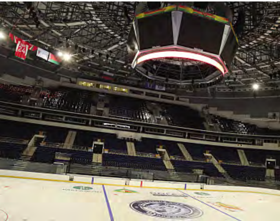
Ice breaker: Having attracted global attention as host of the International Ice Hockey Federation World Championship in May, Belarus wants to promote its hospitality and openness to foreign investors. The country already has a strong manufacturing sector comprising both foreign firms, such as Swiss light railway vehicle maker Stadler (top left), and state-owned companies, such as automotive firm BelAZ (top right)