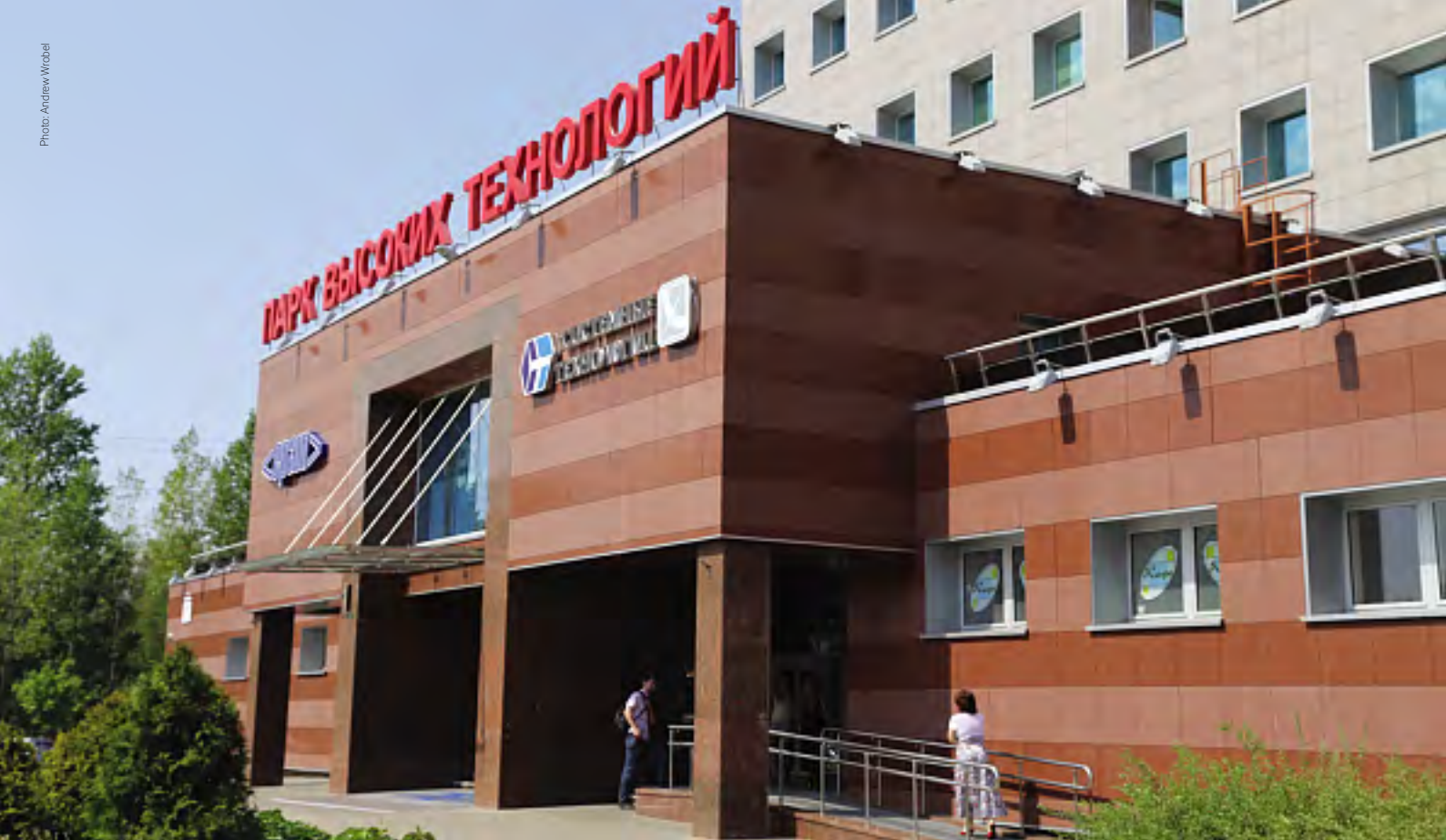
Opening doors: since it opened in 2005, the Hi-Tech Park (pictured) in Minsk has been a focal point of Belarus's IT sector, which is now worth more than $500m per year