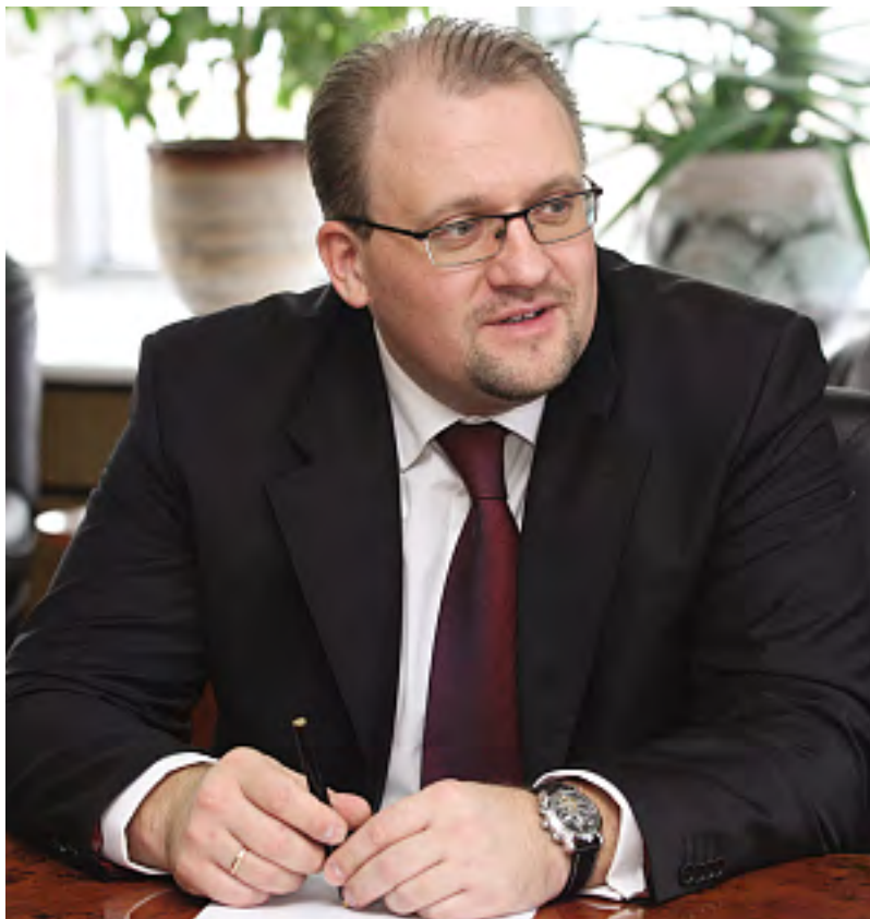
Aleksandr E Guryanov, Belarus's deputy foreign minister

About 45% of our foreign trade is with Russia and almost 40% with the EU, which implies that these partners are of equal importance to us. That is why we suggested discussions between the European Commission and the Eurasian Economic Commission, in the hope that such talks would enable us to remove some of the technical and regulatory barriers between the two unions, thus increasing collaboration. Unfortunately, politics has prevented such talks taking place. ■