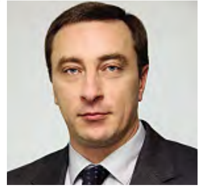
Nikolai Snopkov, Belarus's minister of the economy

A Aleksandr E Guryanov: Now, thanks to the Eurasian Economic Union, many companies are coming to Belarus to start their