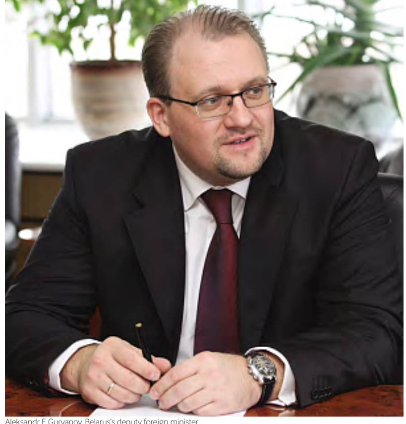
Aleksandr E Guryanov, Belarus's deputy foreign ministe

About 45% of our foreign trade is with Russia and almost 40% with the EU, which implies that these partners are of equal importance to us. That is why we suggested discussions between the European Commission and the Eurasian Economic Commission, in the hope that such talks would enable us to remove some of the technical and regulatory barriers between the two unions, thus increasing collaboration. Unfortunately, politics has prevented such talks taking place. ■