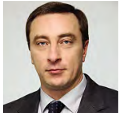
Nikolai Snopkov, Belarus's minister of the economy

Aleksandr E Guryanov: Now, thanks to the Eurasian Economic Union, many companies are coming to Belarus to start their