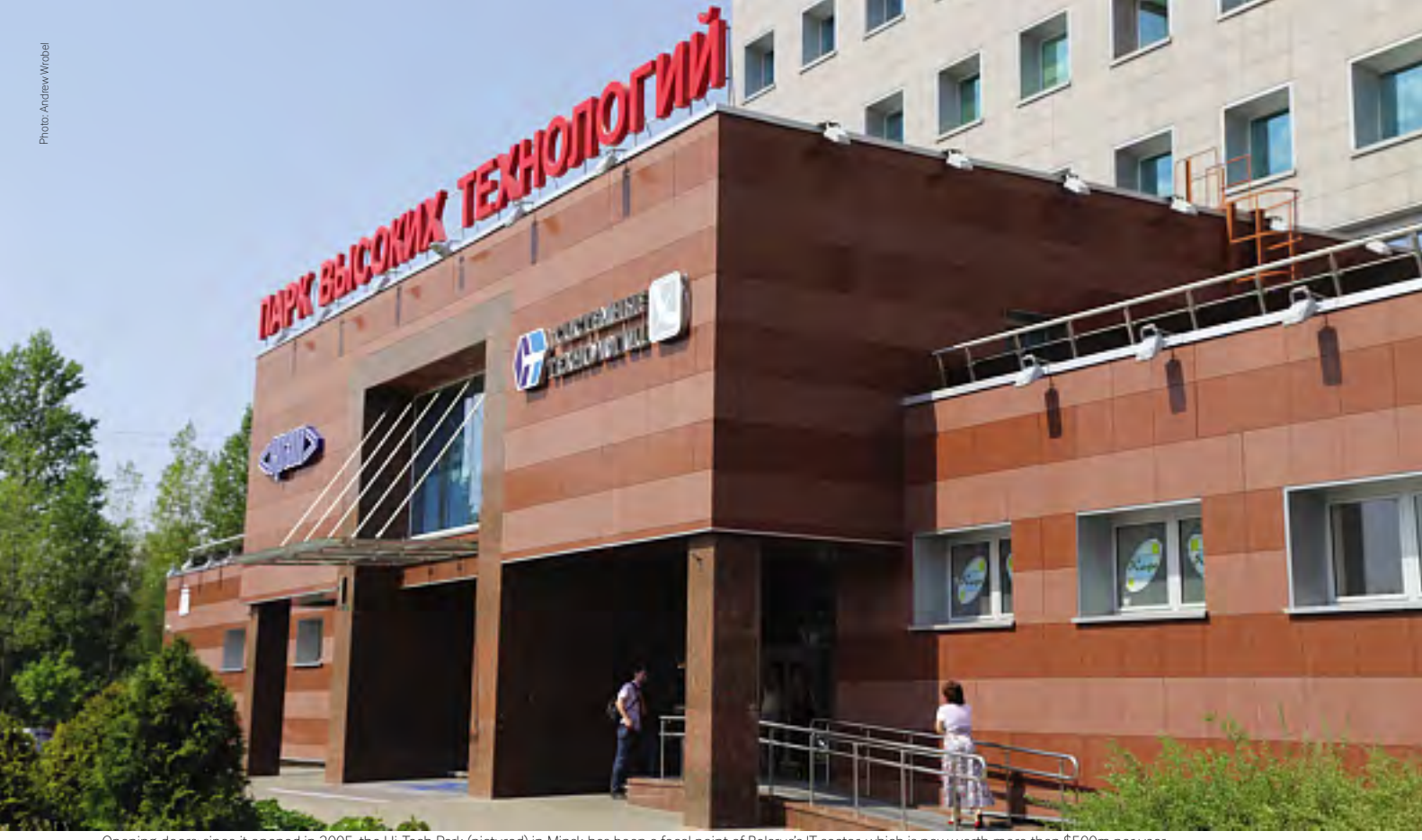
Opening doors: since it opened in 2005, the Hi-Tech Park (pictured) in Minsk has been a focal point of Belarus's IT sector, which is now worth more than $500m per year