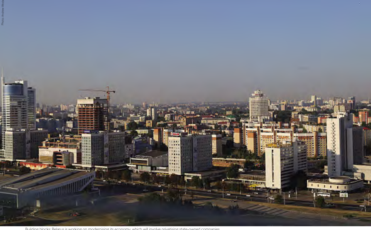
Building blocks: Belarus is working on modernising its economy, which will involve privatising state-owned companies

international trade. According to the European Commission, however, the EU-Belarus bilateral trade in goods has been growing steadily in recent years and the EU is now Belarus's second main trade partner, with almost a one-third share in the country's overall trade.